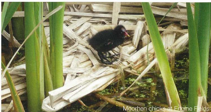
Moorhen chicks at Engine Fields

This traffic-free greenway provides safe access to Yeadon Westfield Junior and Infant Schools and Saints Peter and Paul Catholic Primary School. It is hoped to link the routes to the nearby Benton Park and Guiseley schools in the future.