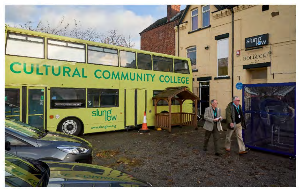
Delegates leave The Holbeck for a short bus ride back to Leeds City Centre

Further information about the Holbeck Neighbourhood Plan and the work of the forum can be found at holbeckneighbourhoodplan.org.uk