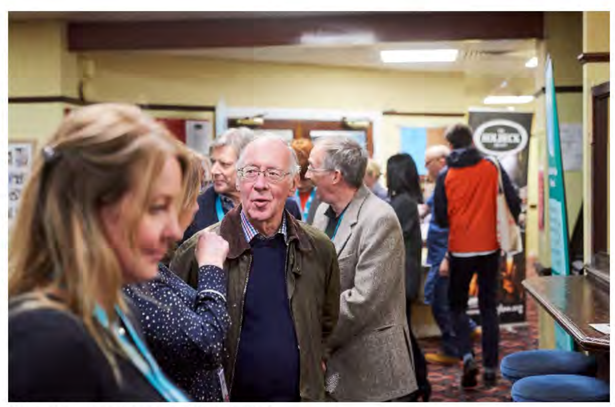
Delegates are welcomed into The Holbeck