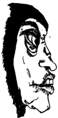
THE HISSING MONK

Q. Where was the great beast seen? On the Front Lawn Near the lakes On Rhododendron Walk