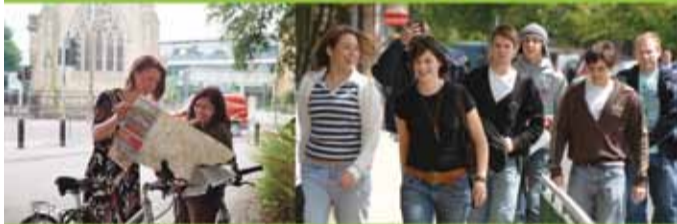
Promoting cheap, fun and healthy everyday travel

UTravelActive is promoting walking and cycling among students, staff and the local community: