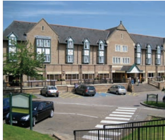
The Village Hotel & Leisure Club

Radisson Blu Hotel Leeds, No 1 The Light, The Headrow, Leeds LS1 8TL Tel: 0113 236 6000 Fax: 0113 236 6100 Email: events.leeds@radisson.com