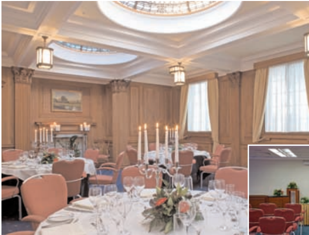
Radisson Blu Hotel Leeds