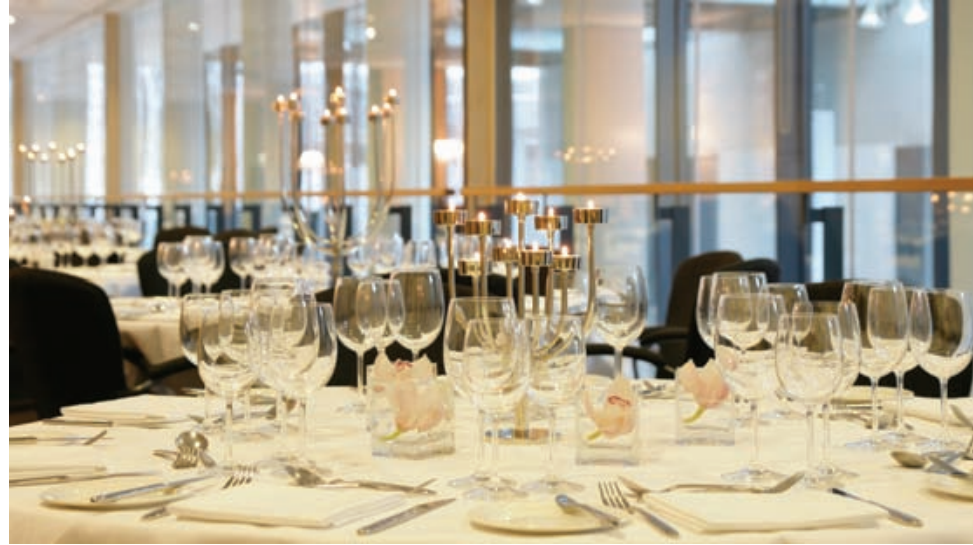
City Inn Leeds

Thorpe Park Hotel & Spa, 1150 Century Way, Leeds LS15 8ZB Tel: 0113 264 1000 Email: thorpepark.events@shirehotels.com Web: www.thorpeparkhotel.com