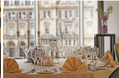
Park Plaza Leeds