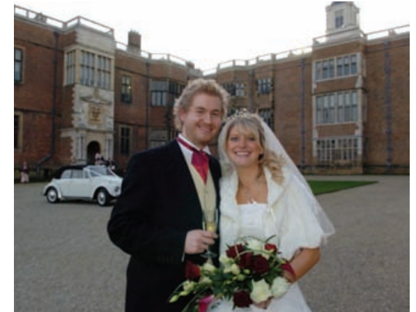
Temple Newsam House

The Village Hotel & Leisure Club, 186 Otley Road, Headingley, Leeds LS16 5PR Tel: 0113 278 1000 option 1 Web: www.village-hotels.co.uk