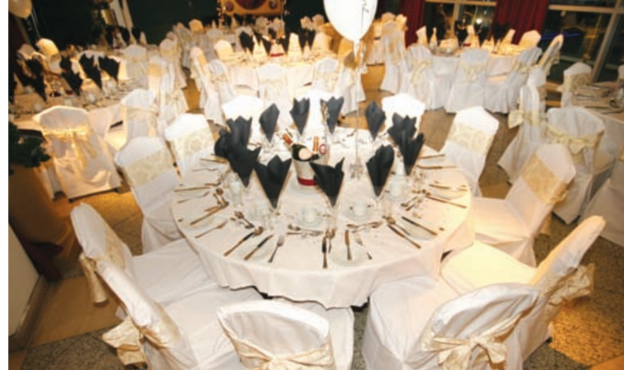
Royal Armouries (International) PLC

Hilton Leeds City, Neville Street, Leeds LS1 4BX Tel: 0113 244 2000 Web: www.hilton.co.uk