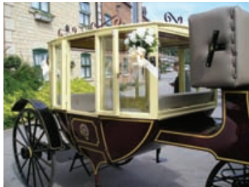
Corn Mill Lodge Hotel, Leeds