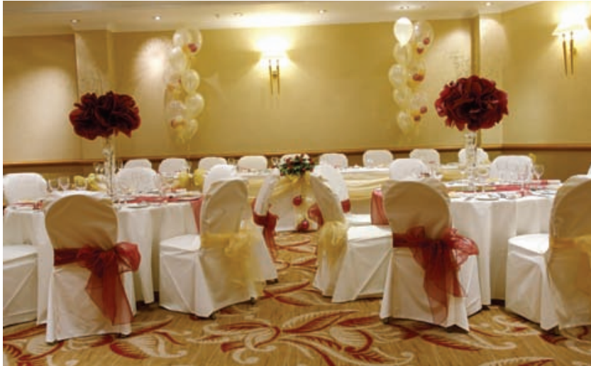
Hilton Leeds City