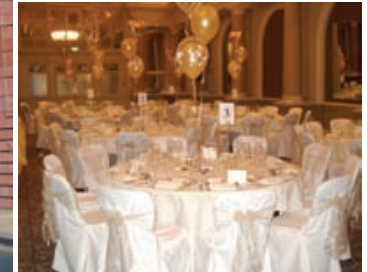
The Met, Leeds