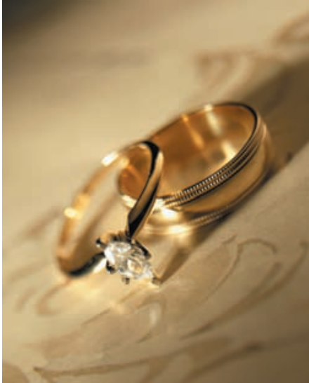
Britannia Hotel Leeds Bradford