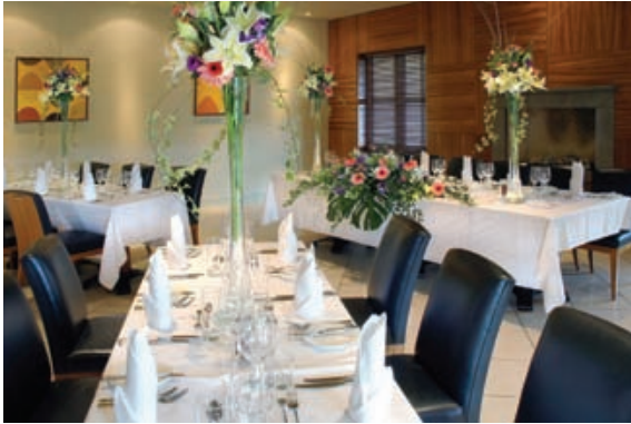
Thorpe Park Hotel & Spa