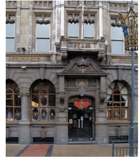
Mr Foley's Cask Ale House

City Inn Leeds, 2 Wharf Approach, Granary Wharf, Leeds LS1 4BR Tel: 0113 243 8885 Email: leeds.reservations@cityinn.com Web: www.cityinn.com/leeds