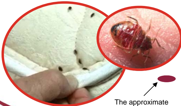
The approximate size of a bedbug