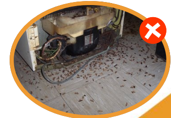
A cockroach infestation