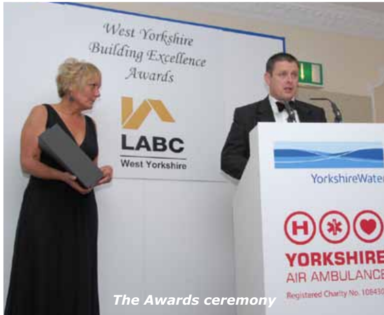
The Awards ceremony

This year's annual awards ceremony was held at the Holiday Inn Hotel, Tong Lane, Bradford on the Thursday 18th June 2009. The awards celebrate high quality and innovative building projects in the West Yorkshire region, from small extensions to major mixed use developments.