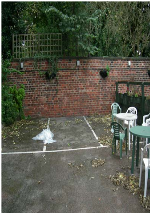
Halcyon Court – Before