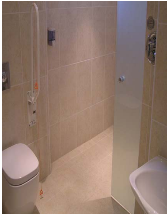
Radcliffe Gardens - After