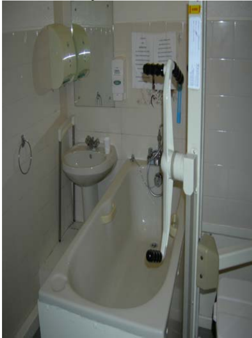
Halcyon Court - Before