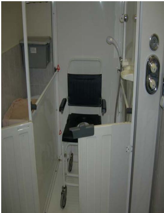
Radcliffe Gardens - Before