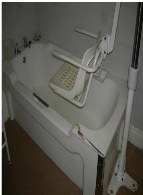
Vivian House - Before