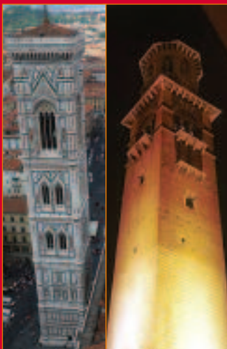
The Giotto and Lamberti towers in Italy.

The project is a potential flagship development to promote the highest standards of urban renaissance and sustainable development in the region. All stakeholders, including local communities, will be consulted in developing the brief.