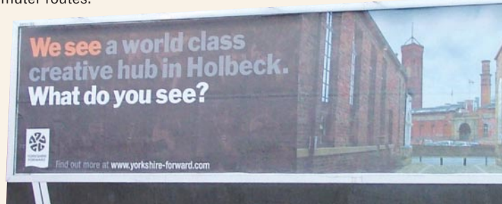
Yorkshire Forward Holbeck Campaign on Kirkstall Road, Leeds