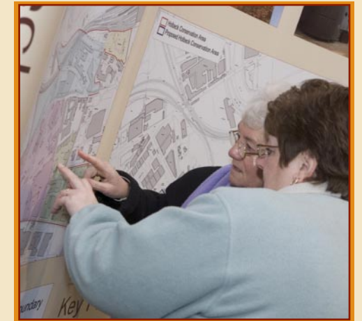
Local stakeholders discuss the proposals and have their say

The Revised Planning Framework Draft and Conservation Boundary Review were launched at the Round Foundry Media Centre where over 100 local residents, businesses, landowners and developers had their chance to comment on the proposed planning guidance for the development of the area.