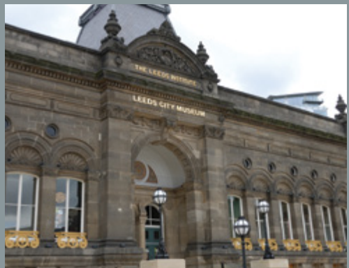
Leeds City Museum

Each has its own unique character and history but comes equipped with modern equipment and facilities, enabling them to be easily adapted to accommodate all your requirements.